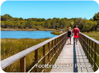
Footbridge of U Paesolu

Difficulty Beginner Duration 3 h 00 Distance 11 km Elevation + 90 m