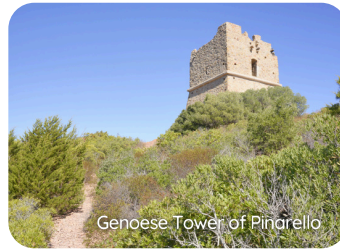
Genoese Tower of Pinarello